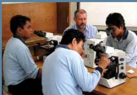
The Project donated this multiple-view microscope to the Bali Department of Health specially for training.

the Indonesian National TB Program to share technical expertise and provide essential training in the diagnosis and treatment of tuberculosis.