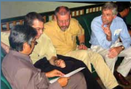
Consortium members in discussions with the Bali department of Health

Overcoming the difficulties of cultural and language differences, the Consortium has successfully developed strong partnerships with